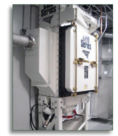
Gold Series Camtain

Safe-change containment systems are available for both the filter cartridges and discharge system. The cartridge change utilizes a bag-in/bag-out (BIBO) method while thedischarge uses continuous liner technology. The Gold Series can also support traditional dust collection for nuisance dusts and fumes that do not require full isolation and containment. Camfil APC has contained and noncontained dust collectors for pharmaceutical applications in the Americas, Asia and Europe.